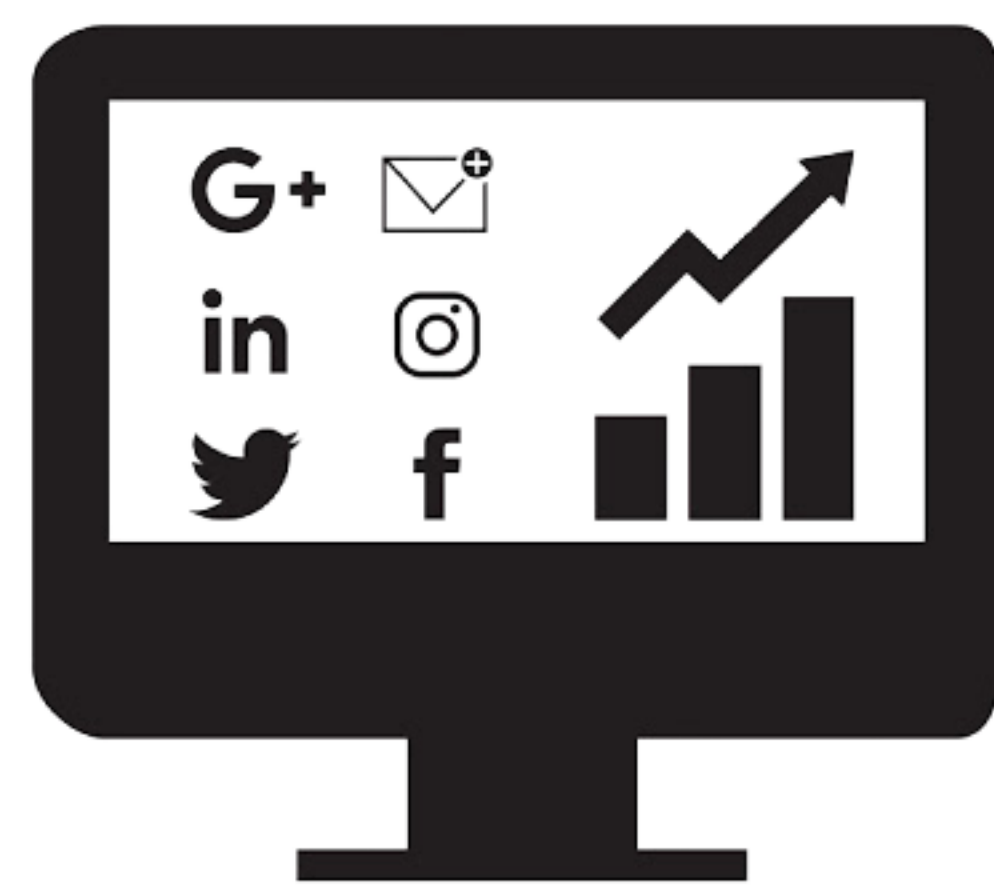
Social Media Advertising