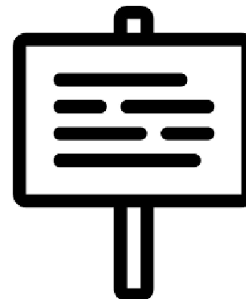
Banners on Display

MJ Productions Summer Series, Goat Ropings and the Energy Capital Junior Rodeo are striving to preserve the western lifestyle one cowboy and cowgirl at a time. Rodeo is deeply rooted in our western heritage, standing as the backbone of Wyoming in many ways. It has so much to teach the next generations by instilling accountability, perseverance, a strong work ethic and so many other skills that will serve them throughout their lives. Rodeo has certainly influenced our lives. From the responsibilities it teaches to the friends we make along the way, rodeo has impacted us in so many positive ways. We hope you join us in our mission to continue to preserve the western way of life!